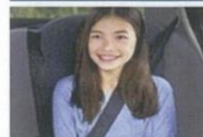
145cm or taller Suggested minimum height to use adult lap-sash seatbelt