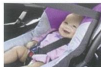
Up to 6 months Approved rear-facing child car seat