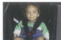
6 months to 4 years Approved rear- or forward-facing child car seat