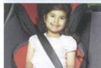
4+ years Approved forward-facing child car seat or booster seat