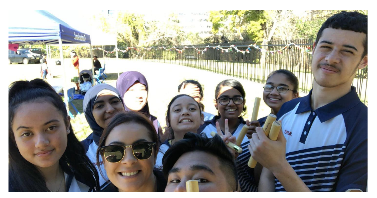
Our Fantastic Dance Group